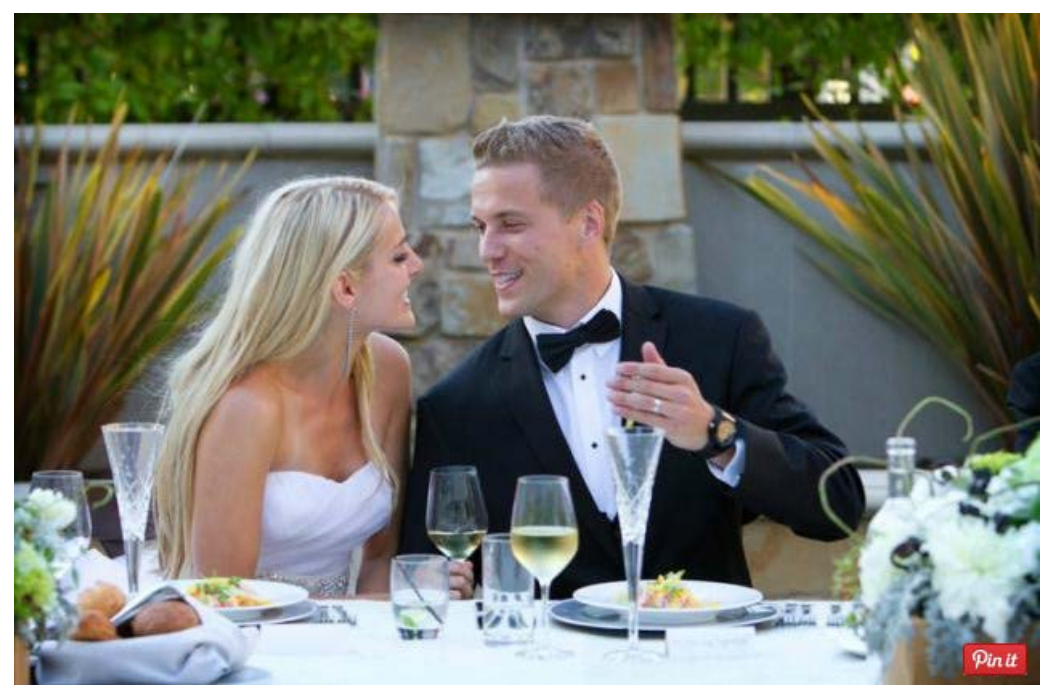
Newlyweds share a toast