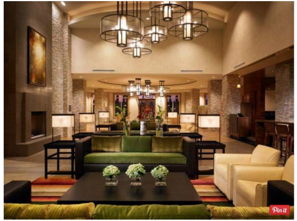
The lobby is a setting for wine tastings.