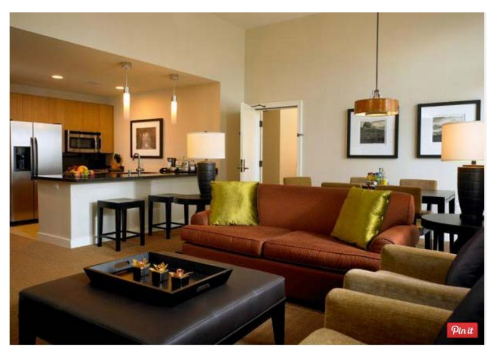
A two-bedroom suite provides all the comforts of home.