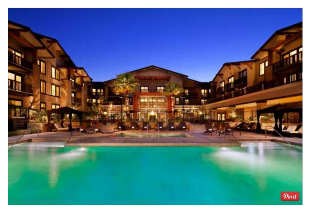
The pool area glows romantically at night