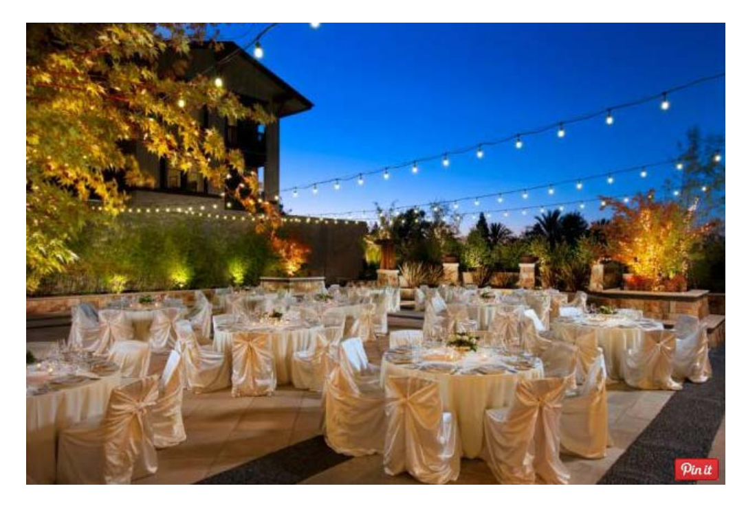
The Solera courtyard all dressed up for a wedding.